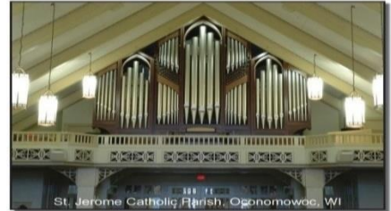
St. Jerome Catholic Parish, Oconomowoc, WI

708-544-4052 • info@berghausorgan.com • 2151 Madison St., Bellwood, IL 60104 • www.berghausorgan.com